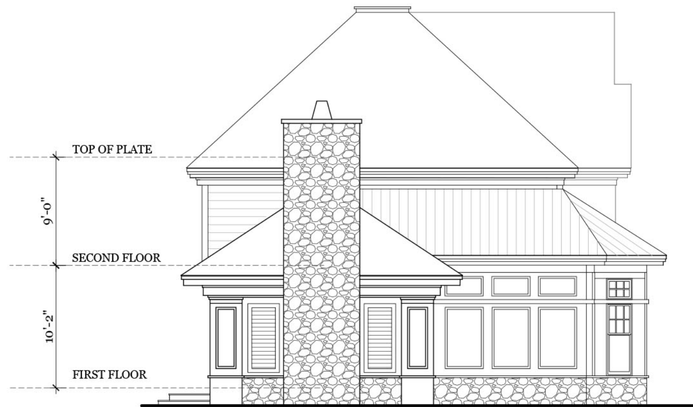
LEFT SIDE ELEVATION Scale: 1/8" = 1'-0"